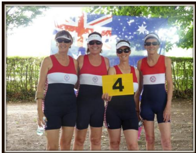
Team of Four - 4 in the crew, lane 4 and came 4 th in their heat!