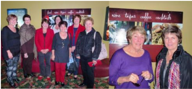
Catching up at Mojo's!